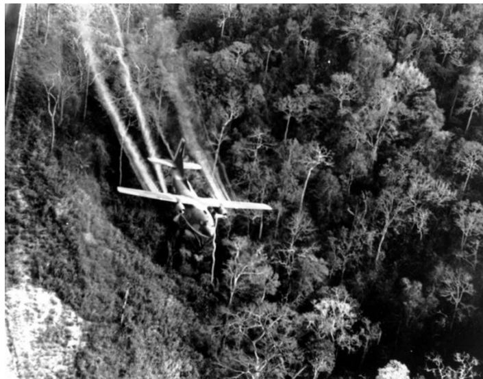
In this May 1966 file photo, a U.S. Air Force C-123 flies low along a South Vietnamese highway spraying defoliants on dense jungle growth beside the road to eliminate ambush sites for the Viet Cong during the Vietnam War.

Some Department of Defense officials were growing impatient with the slow pace of results so they expedited tests elsewhere under the cloak of the highly-secretive Project AGILE. 6 Although, some of the documents concerning AGILE show that defoliant experiments took place in Puerto Rico, Thailand and the mainland United States, the details of the other locations remain classified. Attempts to release the remaining files related to Project AGILE under the Freedom of Information Act have thus far been unsuccessful.